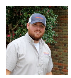
Daniel Rogers Landscape Services