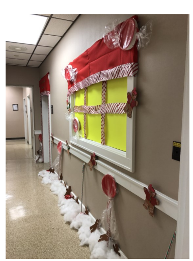
Here are three decorations from previous years