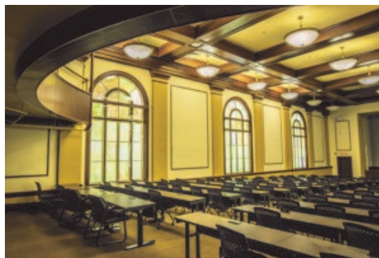
The interior of Clemson University's Holtendorff Hall