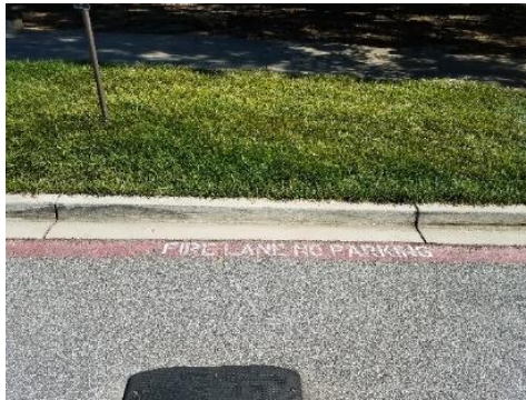
Fire Lane Striping

Red shall not be used to designate any public parking spaces. This color is reserved for Fire Lanes and Service Vehicle Locations only.