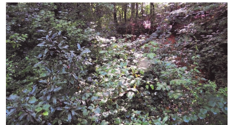
Similar Area After Goats: