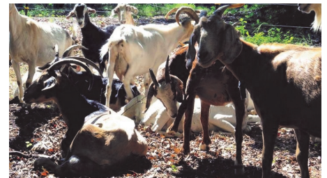
Area Before Goats:

Dozens of hungry goats – immune to poison ivy and oak and impervious to the sharpest of thorns – have clomped heedlessly into dense tangles of invasive plants choking the banks and adjacent areas of Hunnicutt Creek on the Clemson campus.